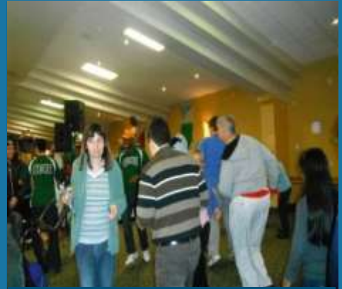
2012 Oktoberfest event at Bingemans