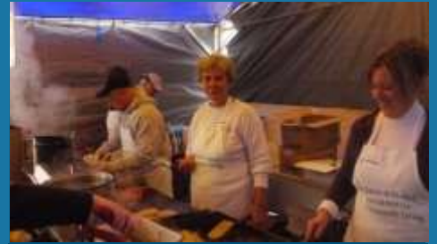
Lunch counter - Sausages on a bun, anyone?