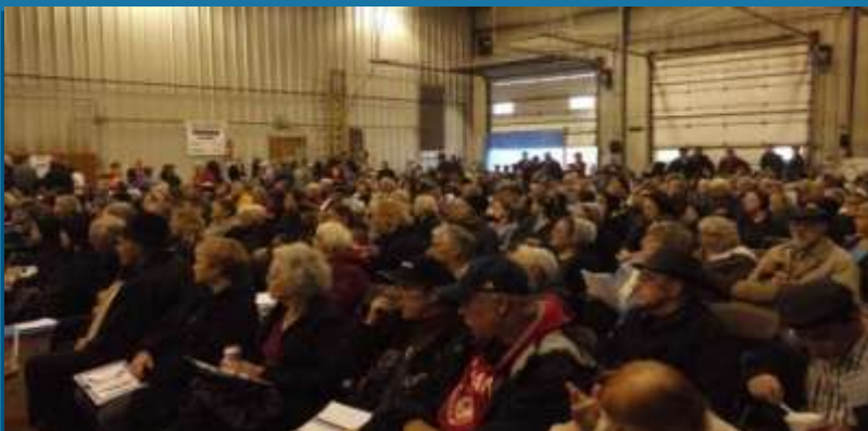
All eyes on the quilt auction