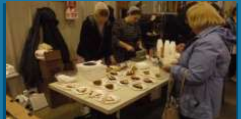
How about pie and ice cream?