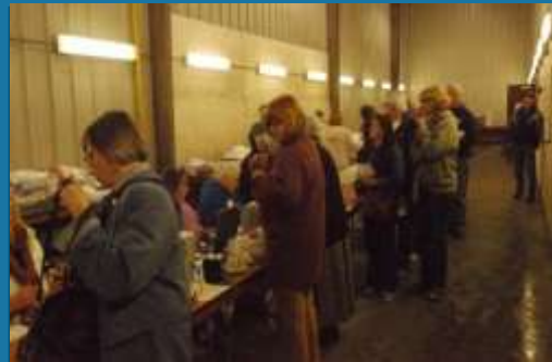
Paying the bill at the end of the day.....