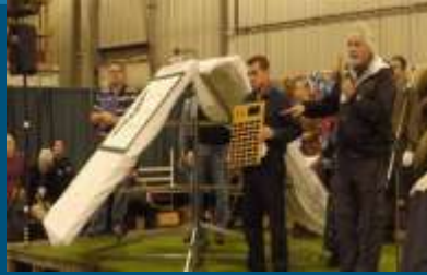
The Benefactor's Quilt was auctioned and raised an amazing $2,400 for EDCL