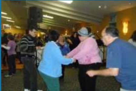
2012 Oktoberfest event at Bingemans