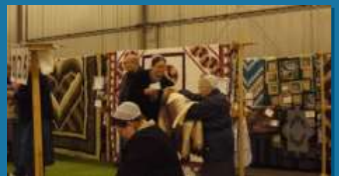
Taking the quilts to the stage. The quilts