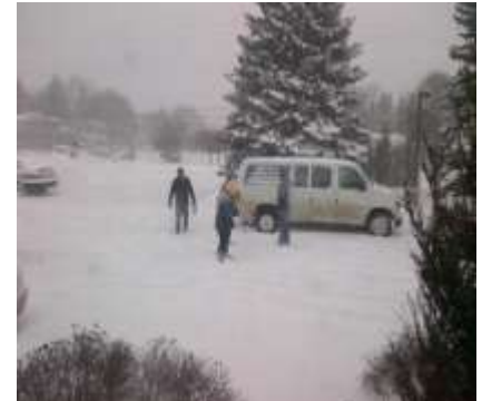
Six Star stuck, isn't it ironic