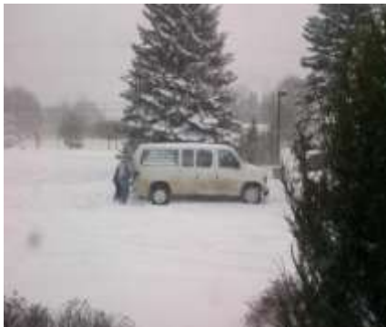
Six Star stuck in the snow