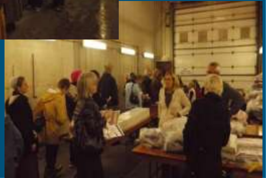
..... and walking away with a beautiful work of art