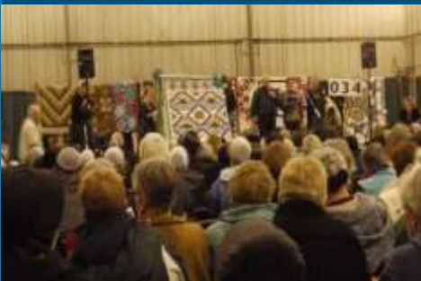
The excitement of a live auction