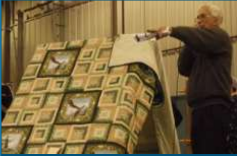
Quilts and more quilts. They tell the story of our community